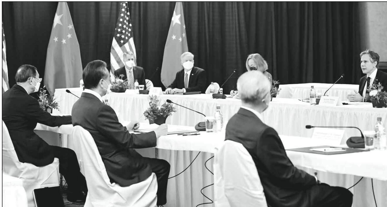
US Secretary of State Antony Blinken (far right) speaks as Chinese diplomats Yang Jeichi (left) and Wang Yi (second from left) listen during the opening session of US-China talks.

While the Trump administration was instrumental in creating worsening attitudes towards China, the new Biden administration also revealed its illusion of US moral superiority. Sullivan lectured the Chinese officials on the "secret sauce of America," that is, the ability to confront challenges and come out more united as a country. In