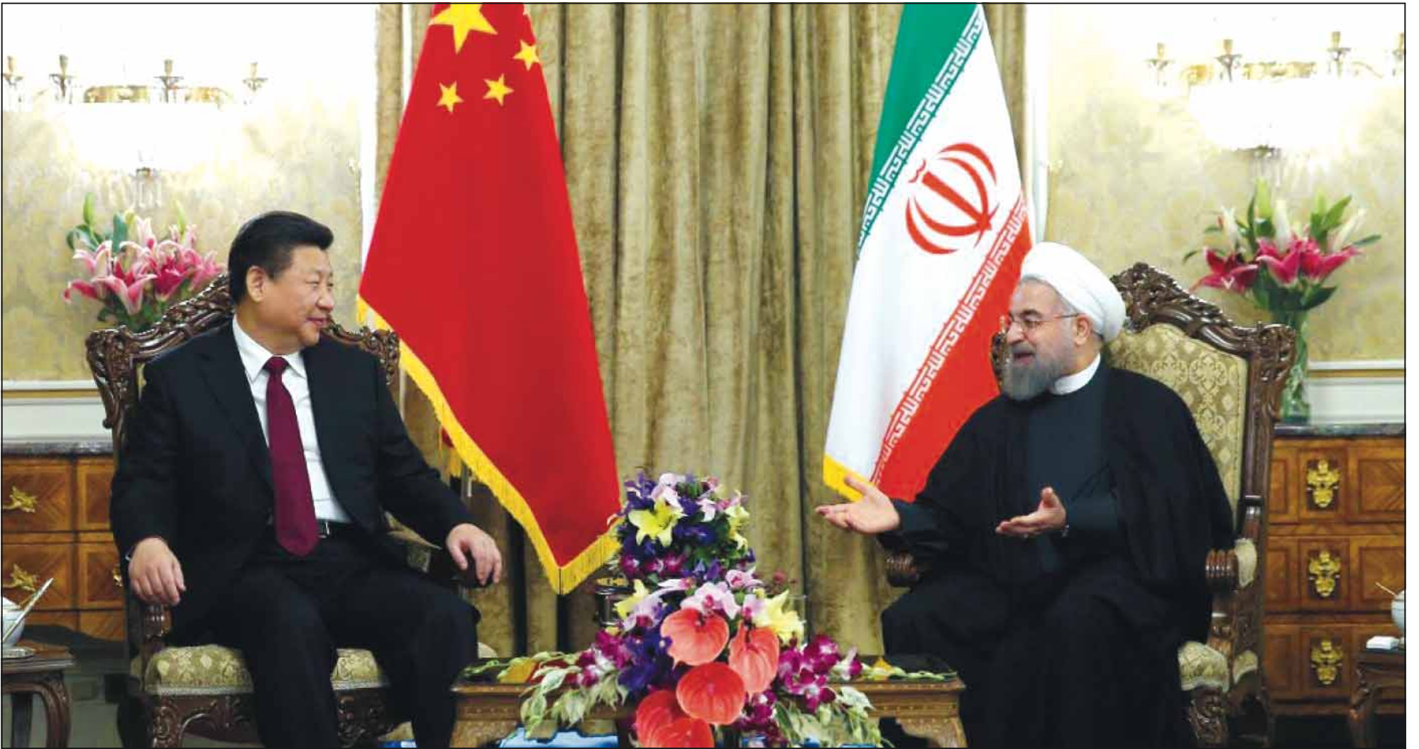
President Xi Jinping and President Hassan Rouhani.