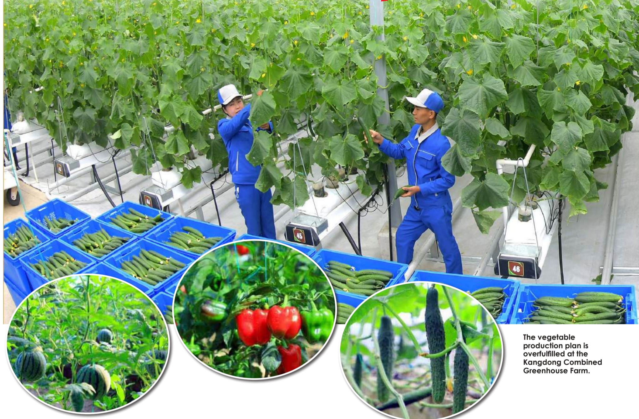
The vegetable production plan is overfulfilled at the Kangdong Combined Greenhouse Farm.