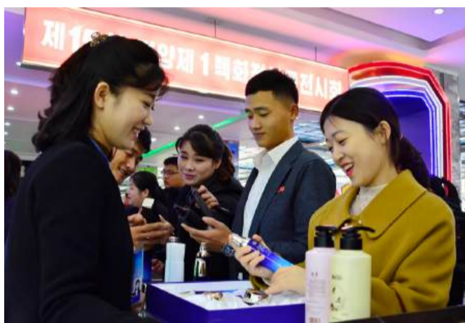
The 15th commodity exhibition of Pyongyang Department Store No. 1 is held between October 29 and November 5.