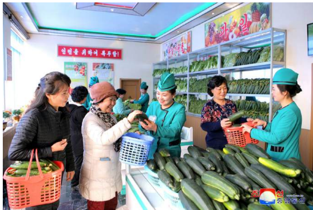
Fresh green vegetables from the Kangdong Combined Greenhouse Farm are supplied to the citizens of Pyongyang.

management and vegetable nutrition management according to the types of greenhouses. Nutrient liquid production and supply bases in different parts of the farm provide necessary nutrient solutions periodically and regularly without hitch in the growth of vegetables.