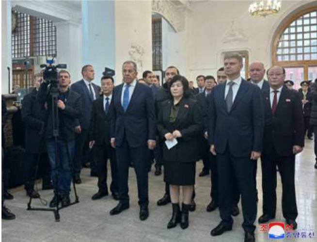
A ceremony is held at Yaroslavl Railway Station on November 1 to unveil a commemorative plaque to the first visit of Comrade Kim Il Sung, premier of the DPRK Cabinet, to the Union of Soviet Socialist Republics in March 1949.

KCNA A press statement on strategic dialogue between Choe Son Hui, foreign minister of the Democratic People's Republic of Korea, and Sergei Viktorovich Lavrov, foreign minister of the Russian Federation, in Moscow on November 1. Prior to the strategic dialogue, the two foreign ministers attended a ceremony held at Yaroslavl Railway Station to honour the first visit of Comrade Kim Il Sung, premier of the DPRK Cabinet, to the Union of Soviet Socialist Republics in March 1949. At the strategic dialogue, there was an in-depth exchange of views on the practical issues for development of the bilateral relations, with the emphasis put on implementing the agreements reached at the DPRK-Russia summit meeting during the DPRK visit