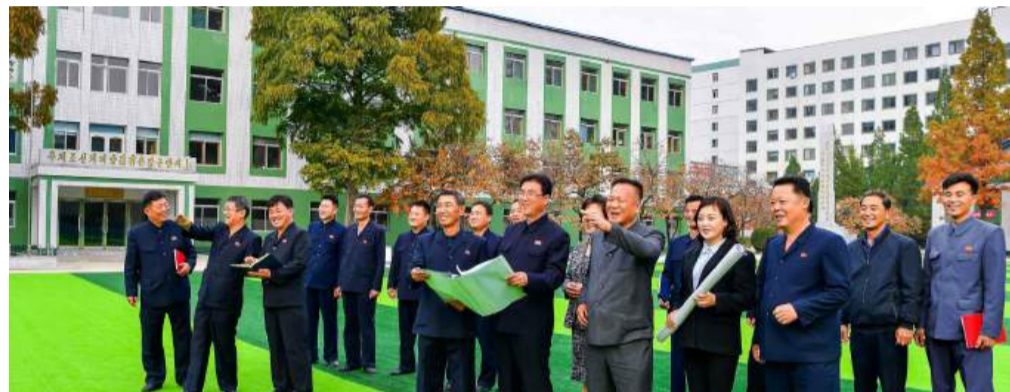
The employees of the Pyongyang Municipal Power Distribution Station and educators of Pyongyang College of Electric Engineering feast their eyes on the improved appearance of the college.

From that time on, the officials and employees of the station have actively tapped latent reserves, made it a duty to save as much as possible and actively joined the effort to offer assistance to education regarding it as their own affair.