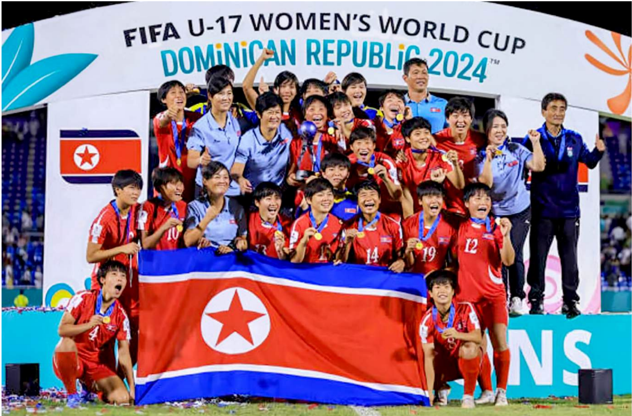
The DPRK defeats Spain 5-4 (1-1 in the first and second halves and 4-3 in the shoot-out) in the final match on November 3 and wins the 2024 FIFA U-17 Women's World Cup.