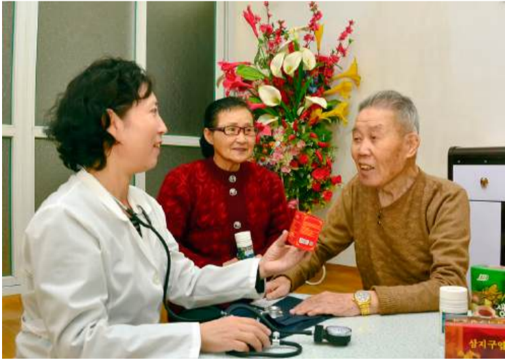
A household doctor of the Inhung Polyclinic in Moranbong District visits residents to treat them.