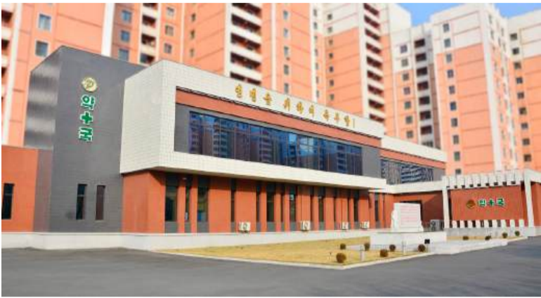
Renovated Mannyon Pharmacy contributes to improving the health of people.

Kangwon Province has pressed on with the work to enhance the role of provincial emergency command post