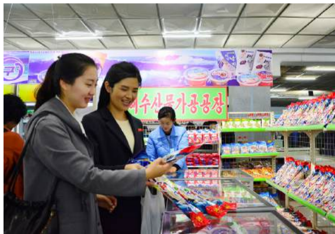
The national exhibition of processed marine products-2024 is going on at the Pyongyang Underground Store under the sponsorship of the Ministry of Fisheries from November 1.

The Kalma Foodstuff Factory, a model of marine