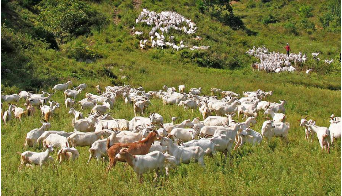
Large herds of goats graze in Changsong County.

are introduced in keeping with the growing number of the animals. Particularly, it has ensured that the nutrition management and anti-epizootic work are carried out in a responsible manner to increase the fattening rate of kids. Meanwhile, the province produced and secured hundreds of tons of powdered milk till the end of September to ensure the regular supply of dairy products for children, unaffected by seasons. A provincial official said that the generalization of experience of advanced areas and units proved effective in the production of dairy products.