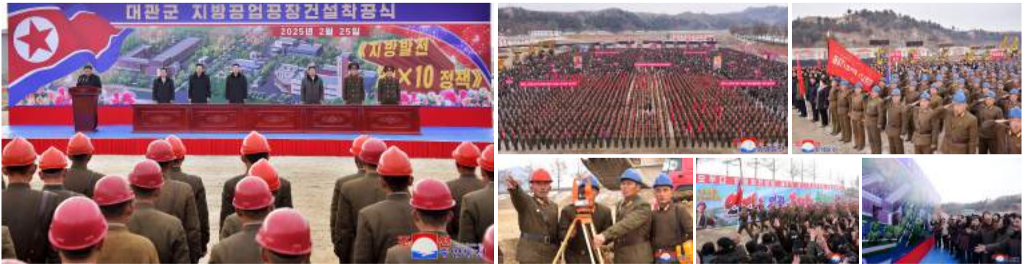
The construction of regional-industry factories begins with a groundbreaking ceremony in Taegwan County on February 25.