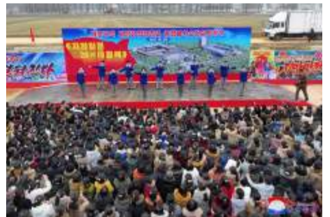
A groundbreaking of regional-industry factories and a leisure complex takes place in Kaepung District on February 28.