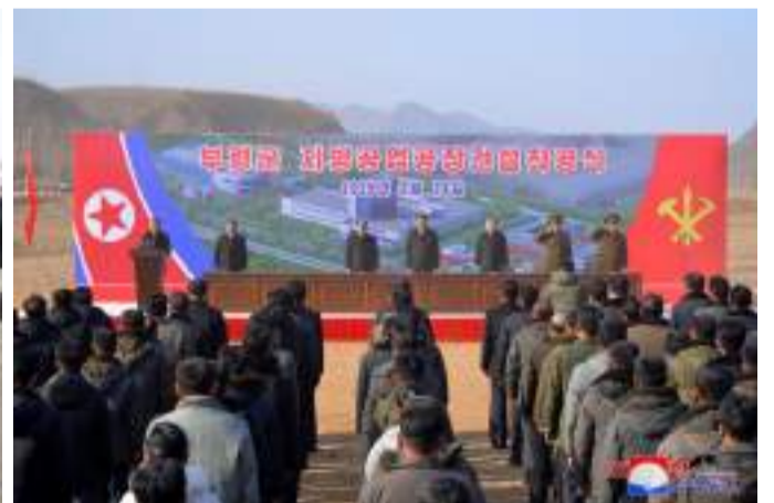
Groundbreaking ceremonies of the Unsan Paper Mill and regional-industry factories of Puryong County are held on February 28.