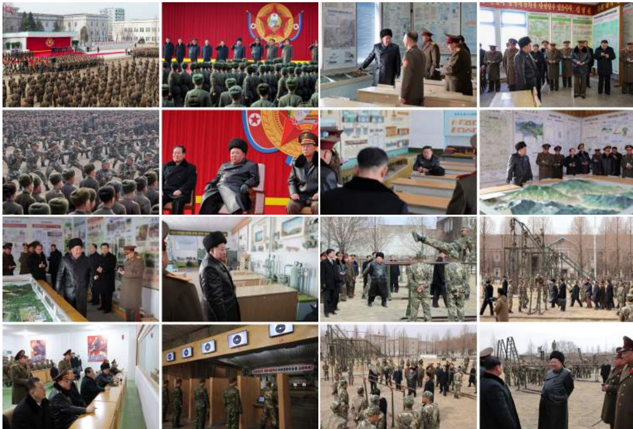
FROM PAGE 9

Saying that the military education front is the eternal first echelon and forefront in increasing the military capability and it is our Party's constant view that a shortcut to training a powerful army is to further raise the flames of revolution in military education, he affirmed that it is his unshakable determination to successfully build this academy as a standard unit in training army commanders, in which modern educational culture is perfectly embodied, and to upgrade the military education sector of the country.