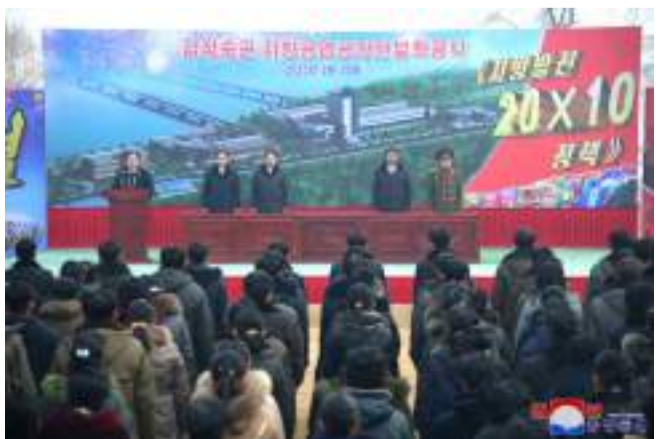
Ceremonies are held to start the construction of regional-industry factories in Jangyon, Kangdong and Kim Jong Suk counties on February 28.