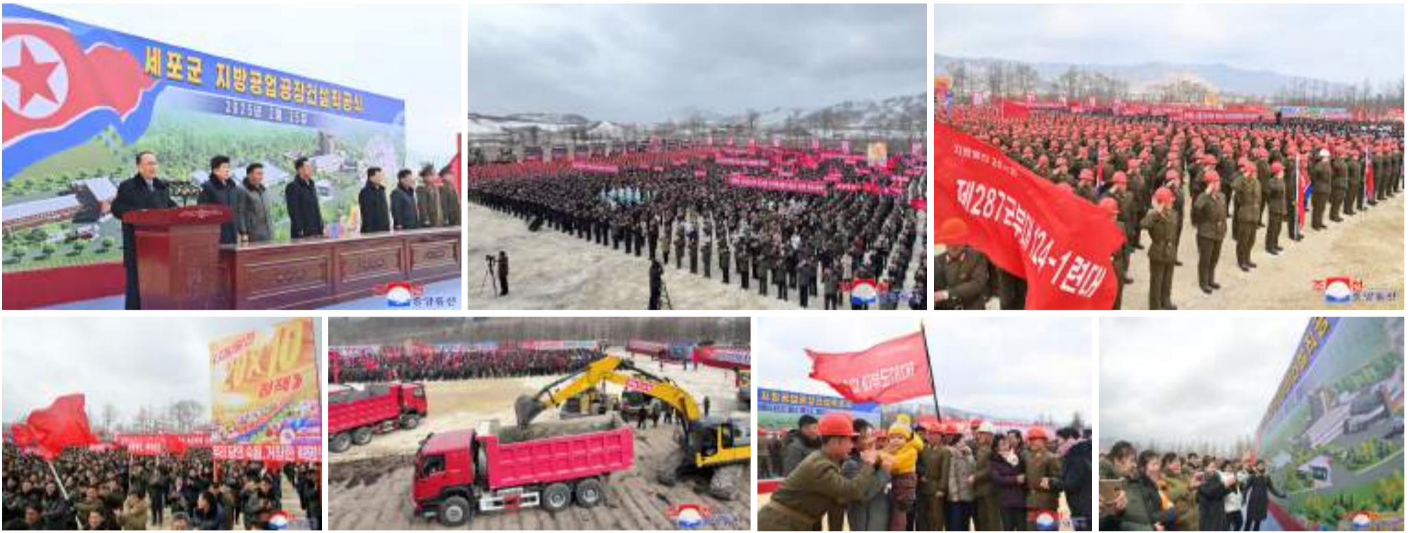
A groundbreaking ceremony of regional-industry factories is held in Sepho County on February 25.