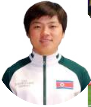
Choe Il Son