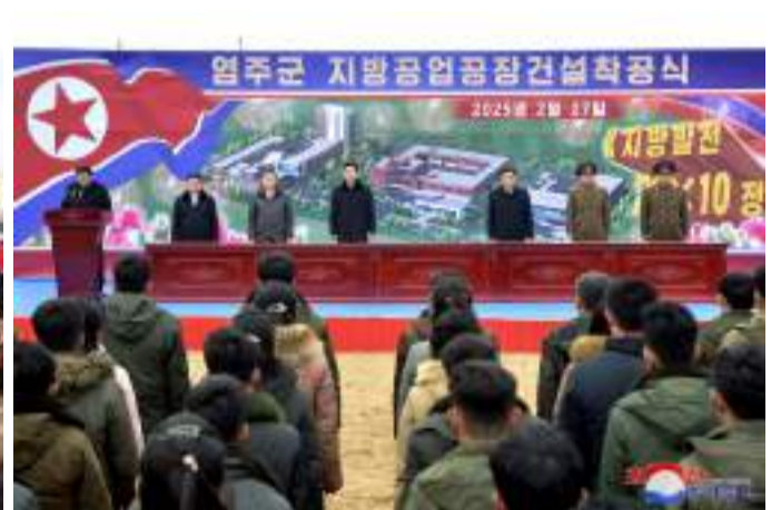
Groundbreaking ceremonies of regional-industry factories take place in Paechon and Yomju counties on February 27.