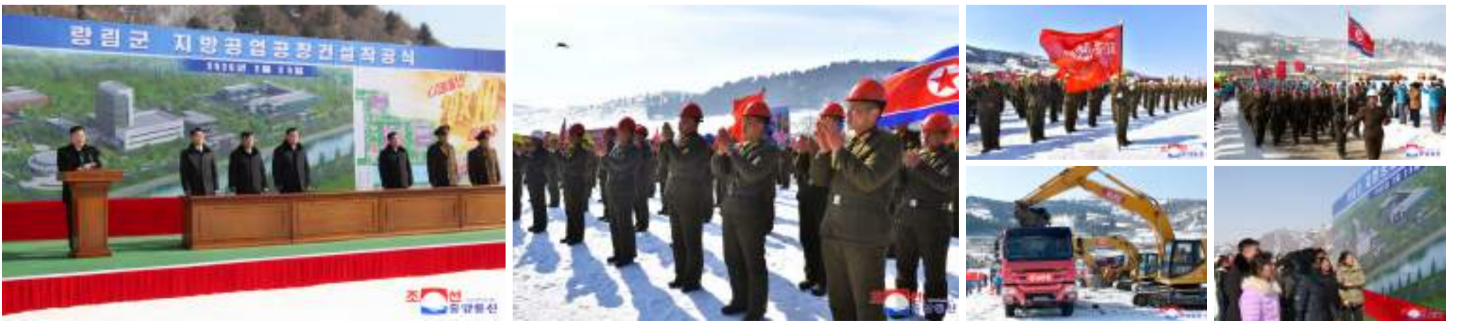
A groundbreaking ceremony of regional-industry factories takes place in Rangnim County on February 25.