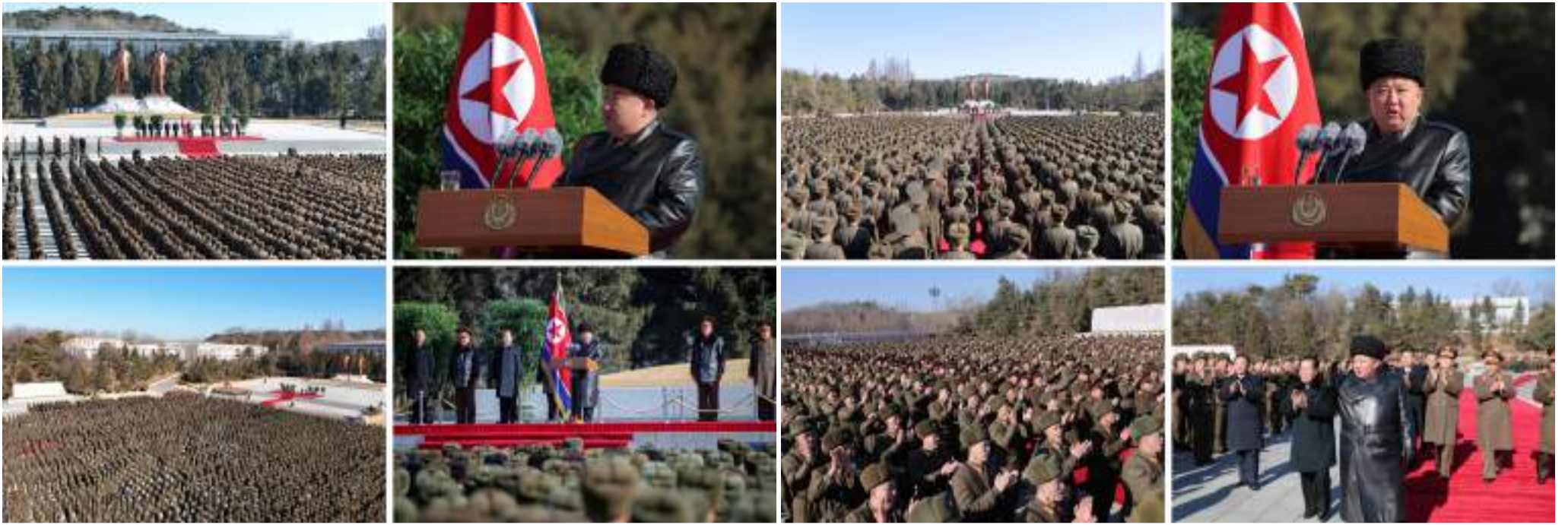
FROM PAGE 5

forces. He noted that the prestige of the university shines with pride in the new era of great changes and transformations and its existence stands out with remarkable meaning as it is a basis of the powerful revolutionary army which is imbued with the ideology of the Party and remains absolutely loyal to its leadership.