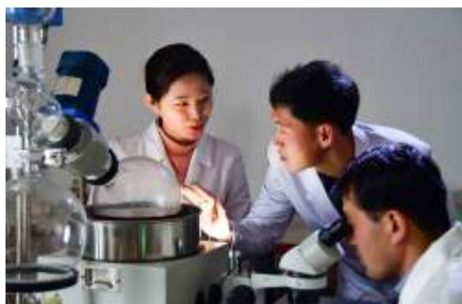
Researchers hold a discussion to develop a new Koryo medicine at the Pharmacology Institute of the Academy of Medical Science.

The Pharmacology Institute under the Academy of Medical Science directs efforts into research into the