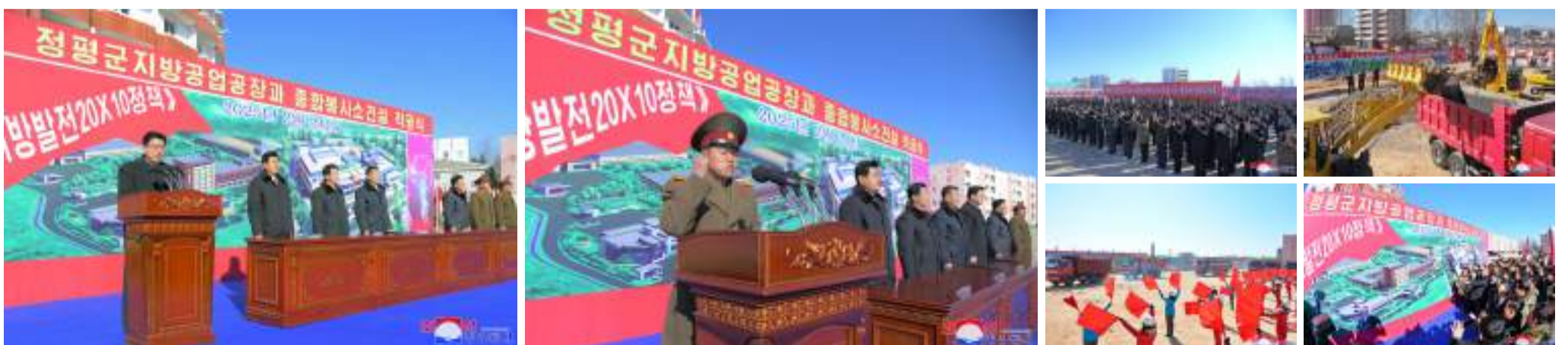
A groundbreaking of regional-industry factories and a leisure complex takes place in Jongphyong County on February 24.