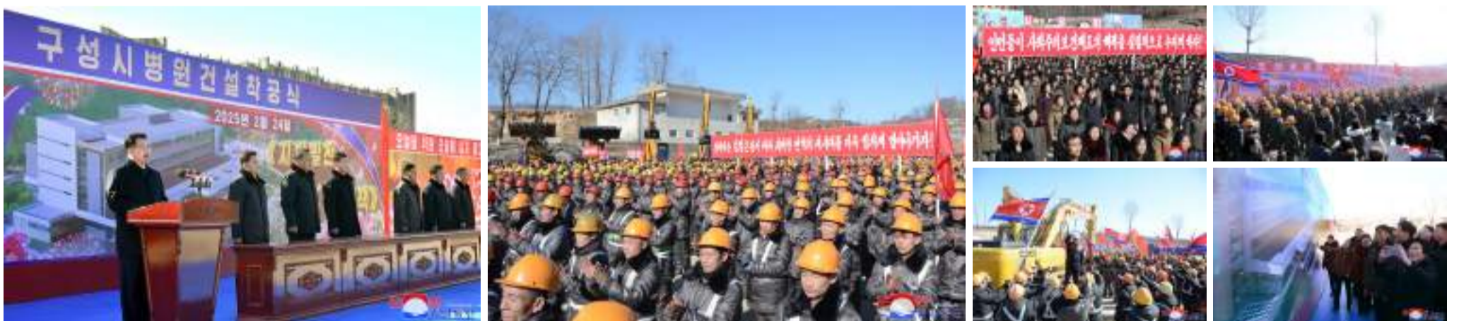
The construction of the Kusong City Hospital starts with due ceremony on February 24.

city and counties, service personnel and builders. At the ceremonies, speakers said that the stirring reality, SEE PAGE 12