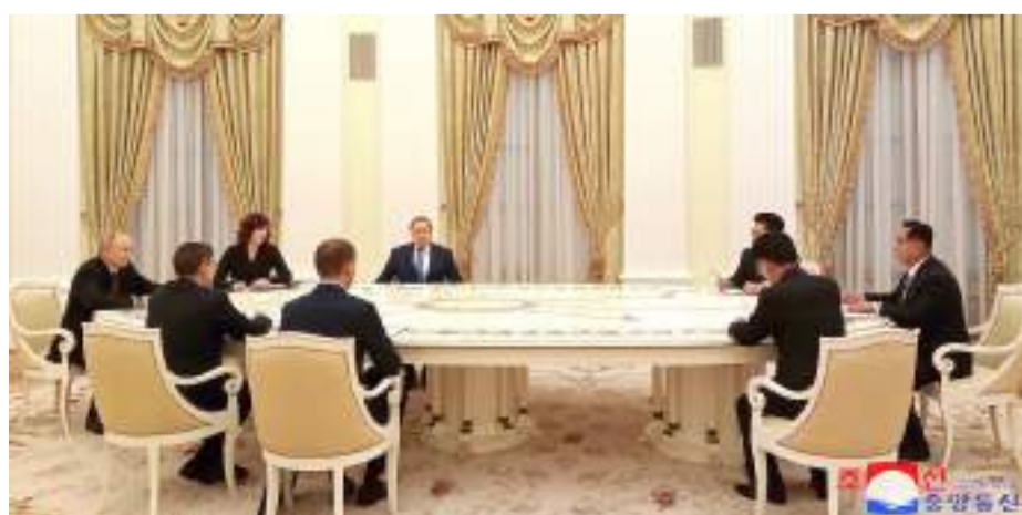
Ri Hi Yong, member of the Political Bureau and secretary of the Central Committee of the Workers' Party of Korea and chairman of the Central Inspection Commission of the WPK, meets with Russian President Vladimir Vladimirovich Putin in the Kremlin, Moscow, on February 27.