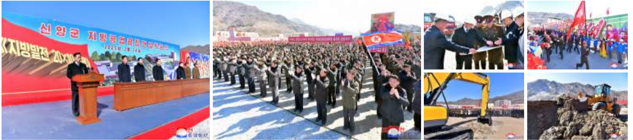
A groundbreaking ceremony is held for the construction of regional-industry factories in Sinyang County on February 24.

Groundbreaking ceremonies of regional-industry factories and public health, leisure and grain storage facilities are held in different parts of the country for implementing Regional Development 20x10 Policy