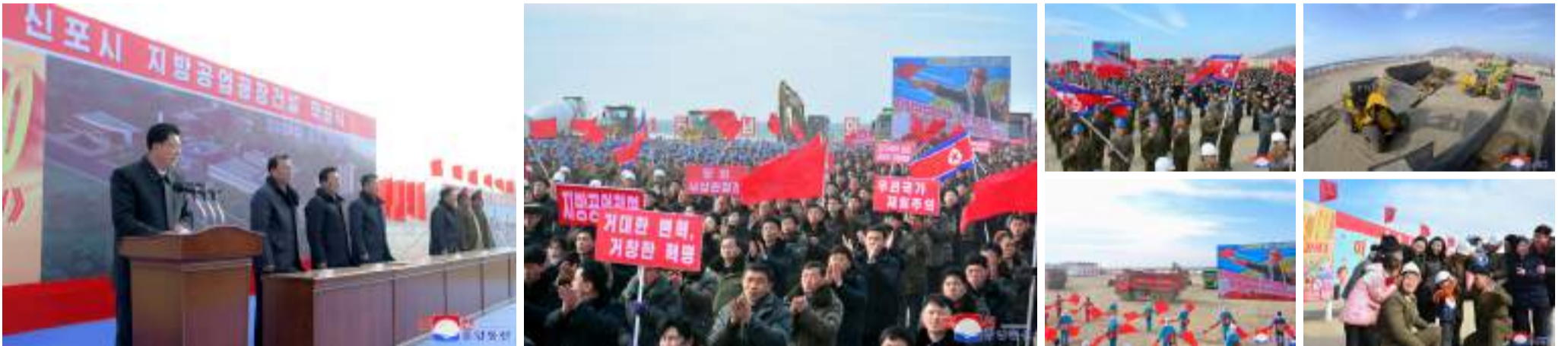
A ceremony is held for the construction of regional-industry factories in the city of Sinpho on February 25.