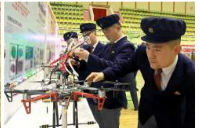
Visitors look round sci-tech achievements with keen interest.