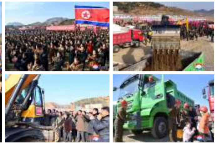
The construction of regional-industry factories starts in Cholwon County with a groundbreaking on February 27.