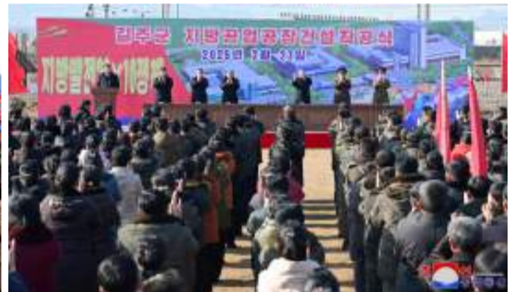
The construction of regional-industry factories begins in Pukchang and Kilju counties with groundbreaking ceremonies on February 27.