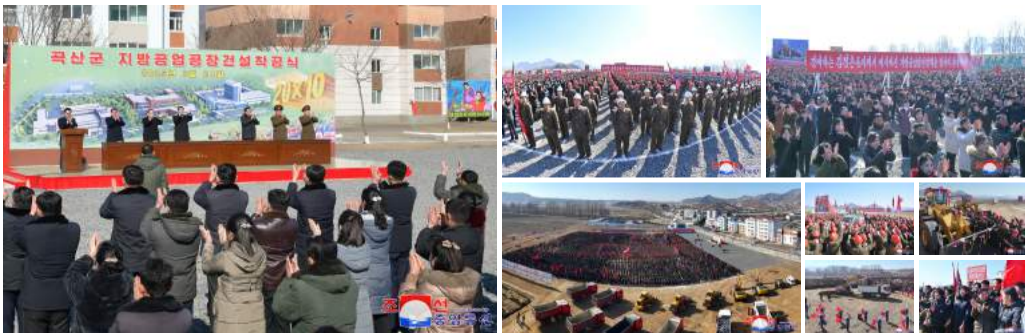
A groundbreaking ceremony of regional-industry factories takes place in Koksan County on February 24.

KCNA The grand construction struggle in 2025 to implement the regional development policy in the new era is going