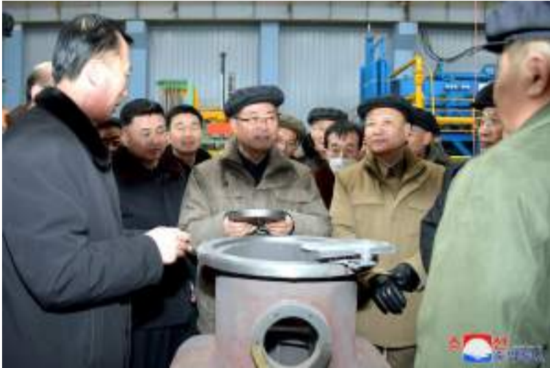
Premier Pak Thae Song (sixth from left) inspects the Ryongsong Machine Complex.