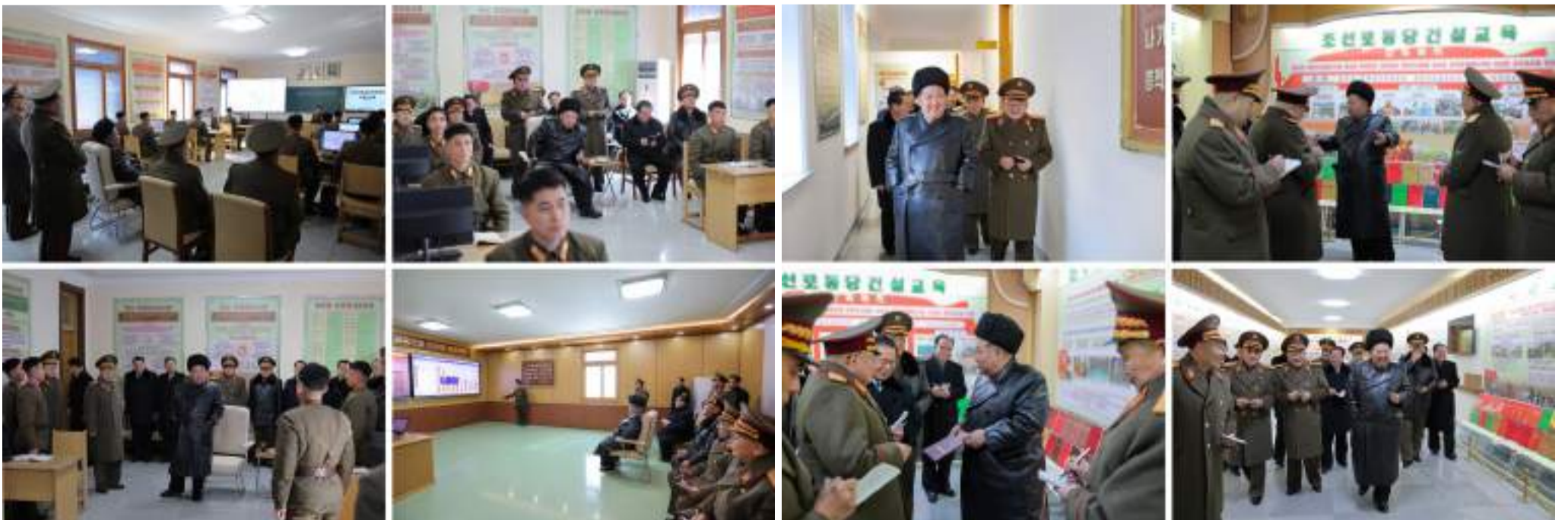
SEE PAGE 7

Saying that the supreme political school of the KPA should surely become the best university in view of its important position and duty directly related to the prospect of the Korean revolution, he expressed the firm will of the WPK to completely improve the educational conditions and