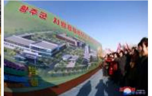
A ceremony is held to start the construction of regional-industry factories and a grain storage station in Hwangju County on February 26.