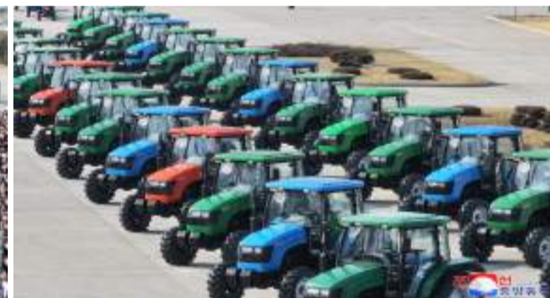
A ceremony takes place at the Kumsong Tractor Factory on February 15 to inaugurate the second-stage upgrading project.