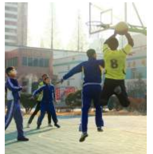
Employees run in a race and play basketball game at the Pyongyang General Electric Cable Factory 326.