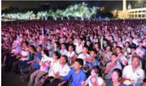
"Dear Father", "Song about the Motherland" and other famous songs of the times are created and put on the stage(left).