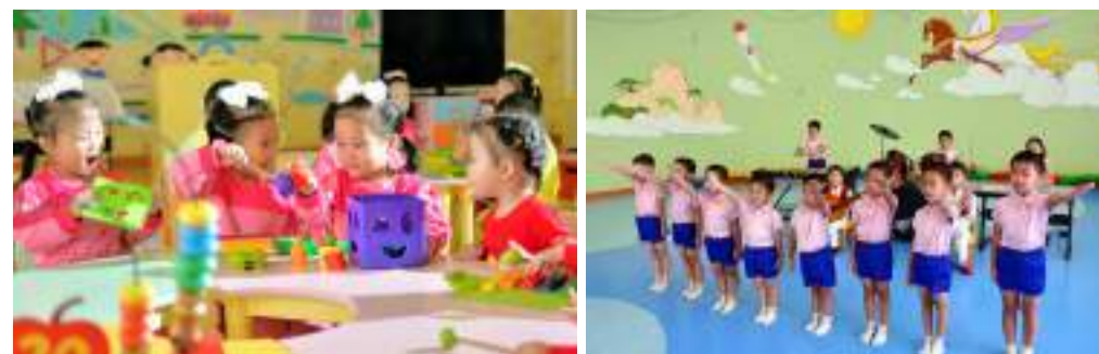
Orphans grow happily at the Pyongyang Baby Home and Pyongyang Orphanage.

Thanks to the policy of love for younger generations of the Workers' Party of Korea, which pours more love on children at the time of hardship and advances persistently toward the future of communism on the strength of love, the song We Are the Happiest in the World sung by children continues to ring out from the childcare facilities in Pyongyang.