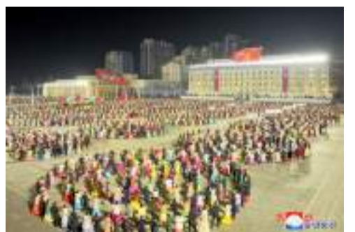
Youth and students in Pyongyang have an evening gala at Kim Il Sung Square on the evening of February 16.