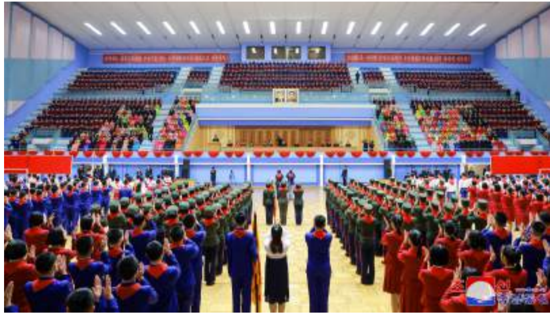
A joint national meeting of the Korean Children's Union organizations takes place in Pyongyang on February 16, the 83rd birth anniversary of the great leader Generalissimo Kim Jong Il.

The reporter noted that Generalissimo Kim Jong Il