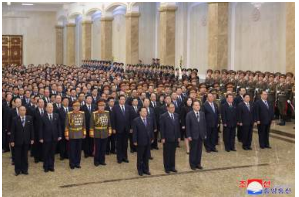
Senior Party and government officials of the DPRK visit the Kumsusan Palace of the Sun on February 16, the 83rd birth anniversary of Chairman Kim Jong Il.