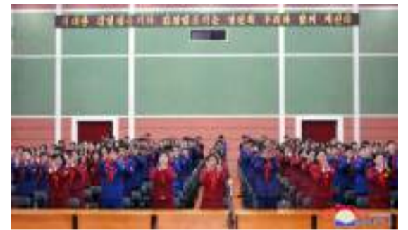
A meeting for starting the camping is held at the Jangjasan Children's Camp on February 16.