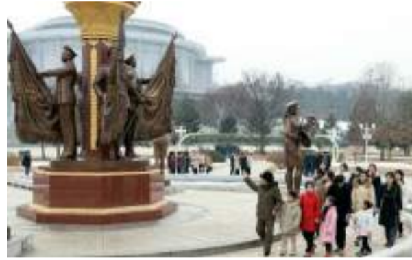
All the people of the country joyfully celebrate the birth anniversary of Chairman Kim Jong Il.

in Pyongyang and the provinces visited photo exhibition halls to recollect the noble revolutionary career of the Chairman. There were art performances celebrating the holiday in Pyongyang. Colourful art performances were given in South Phyongan, North Hwanghae, Jagang, Kangwon and South Hamgyong provinces, Nampho Municipality and other regions. Public catering establishments across the country were crowded with visitors.