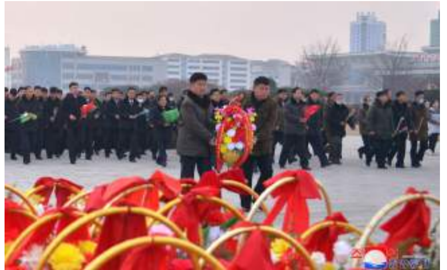
Officials and working people visit the statues of the great leaders in Kangwon Province to pay floral tribute to them.

KPA service personnel, working people, students and schoolchildren in local areas across the country also paid their respect to the peerlessly great men at their statues in localities.