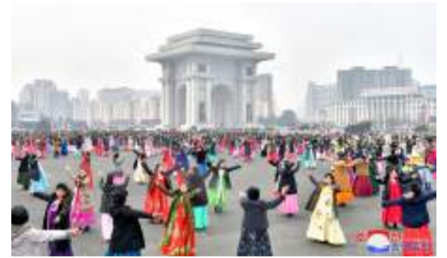
A dance party of women's union officials and members takes place at the plaza of the Arch of Triumph on February 16.

Dancing merrily, the participants paid the highest tribute to Kim Jong Il.