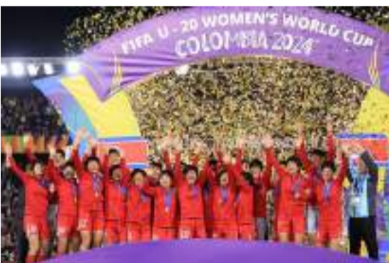
DPRK players win many international sports events to bring honour to the country.