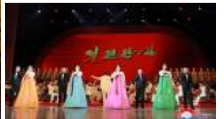
An art performance is given at the Mansudae Art Theatre in Pyongyang on February 16 to celebrate the 83rd birth anniversary of Chairman Kim Jong Il.